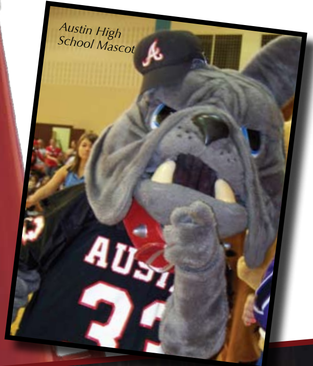
Austin High School Mascot