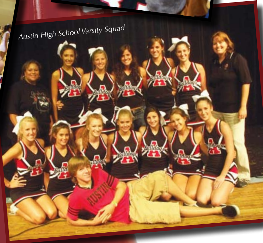
Austin High School Varsity Squad