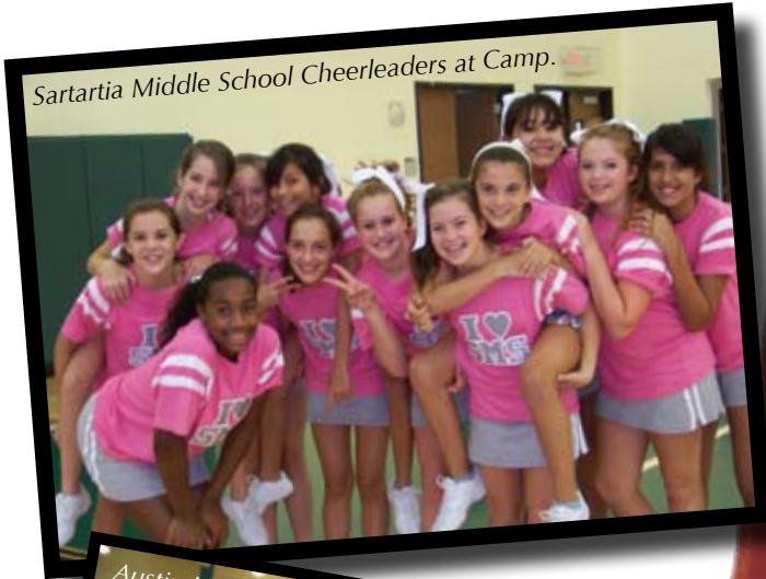
Sartartia Middle School Cheerleaders at Camp.