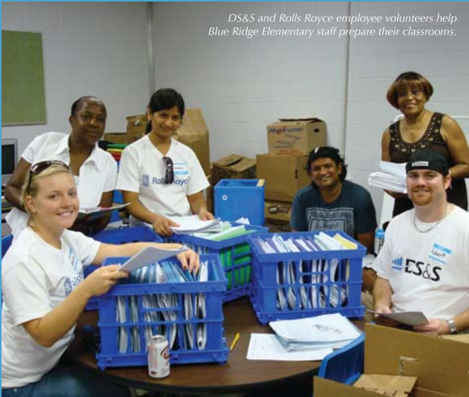
DS&S and Rolls Royce employee volunteers help Blue Ridge Elementary staff prepare their classrooms.