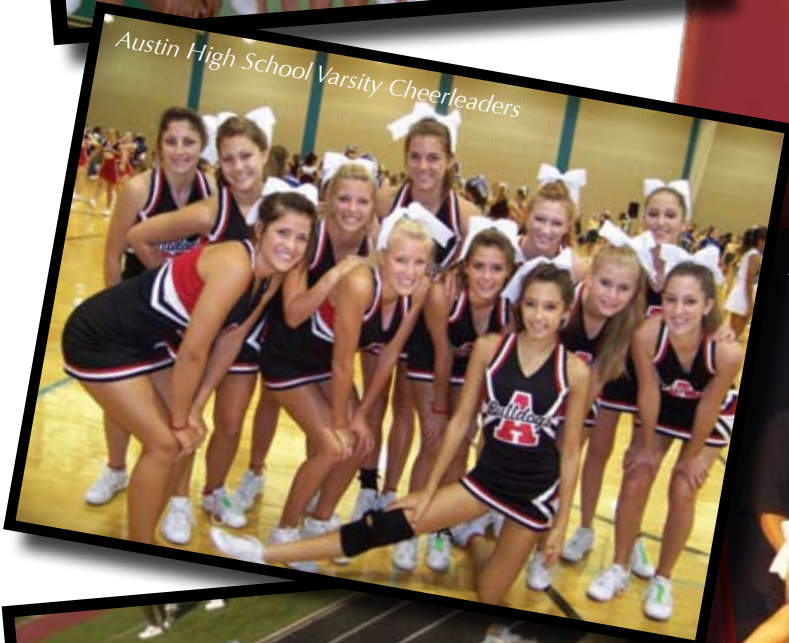
Austin High School Varsity Cheerleaders